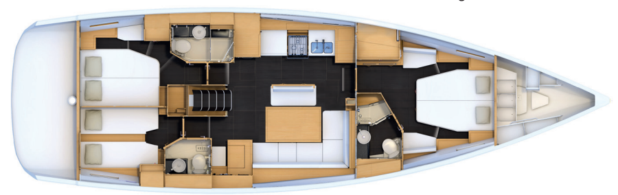
4 cabin version : Two transformable cabins forward, VIP aft cabin, aft guest cabin