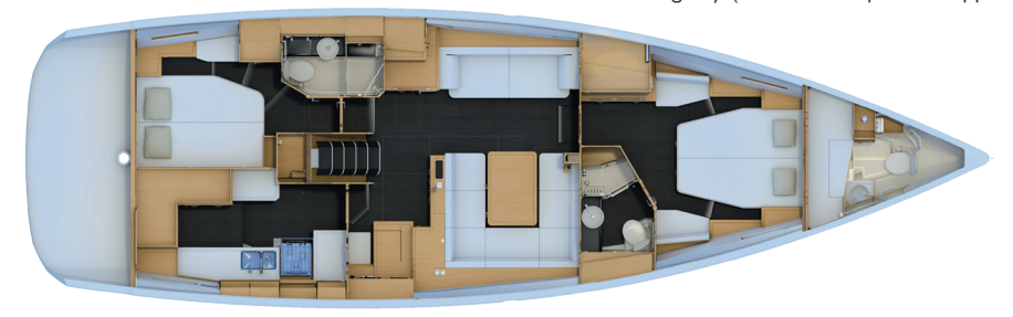
3 cabin version : Forward owner's cabin, VIP aft cabin, aft guest cabin

2 cabin version : Forward owner's cabin, VIP aft cabin, full saloon and aft galley (shown with optional skipper cabin)