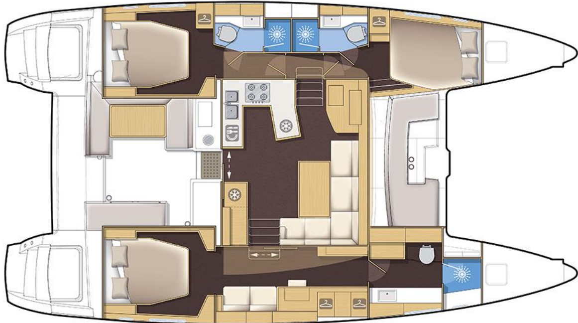
Version 3 cabines / 3 cabin version