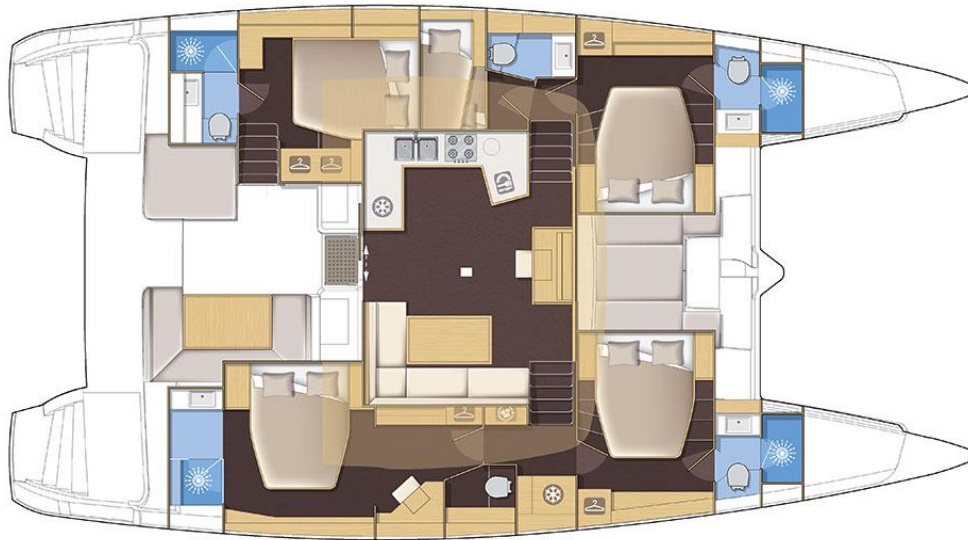
Version 5 cabins / 5 cabin version