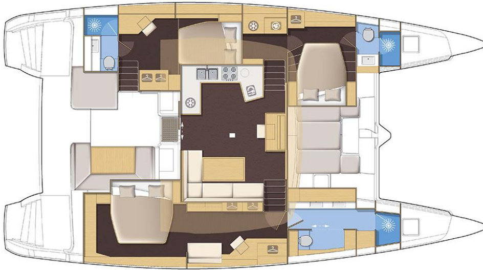
Version 3 cabines / 3 cabin version